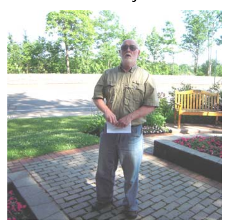
A Taste: 2009-10 Research Series

Non-academic learning influences academic achievement. This year's Series will focus on aspects of nonacademic learning with a tentative title of